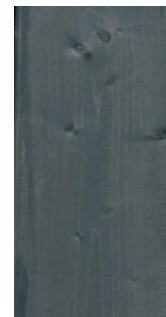
Exterior exposed (horizontally) for 10 month over summer and winter, and maintained* by applying one coat by brush in spring.

Similar results obtained in a extensive wood decking project currently running at Holzforschung Austria.