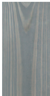
Exterior exposed (horizontally) for 10 months over summer and winter.

Similar results obtained in a extensive wood decking project currently running at Holzforschung Austria.