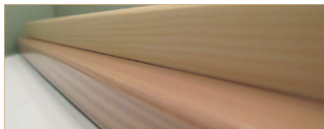
Colourless appearance highlights the natural look of the wood